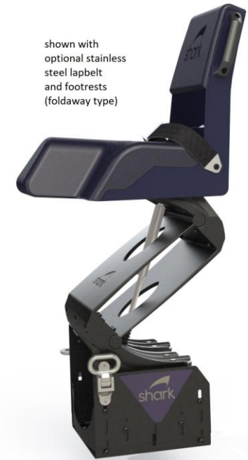
shown with optional stainless steel lapbelt and footrests (foldaway type)