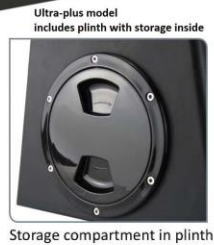
Ultra-plus model includes plinth with storage inside Storage compartment in plinth